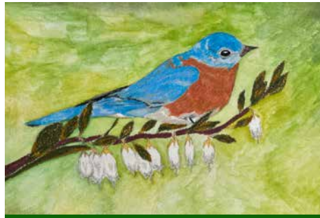
DM, gr 8, Bluebird and Leatherleaf

For their final project of their semester in art class, students created artwork featuring wildlife species of Vermont. These wildly talented young artists focused on capturing thoughtful details and realistic textures, as well as the connections between animals and the world around them.