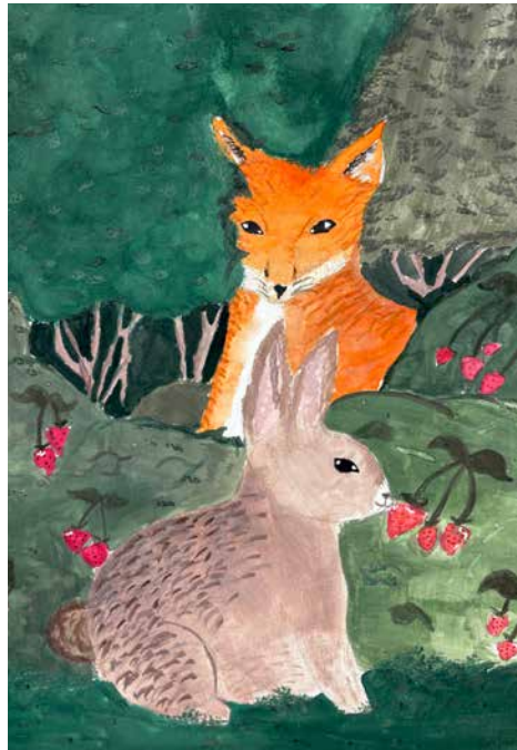
EW, gr 8, Woodland Circle