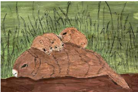
NP, gr 7, A Mother's Love