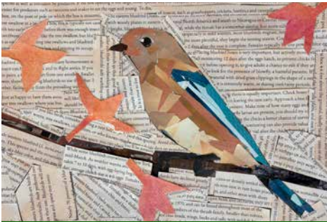
AM, gr 8, Eastern Bluebird