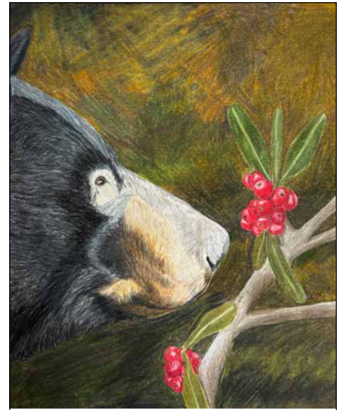
CK, gr 8, The Bear and the Bees