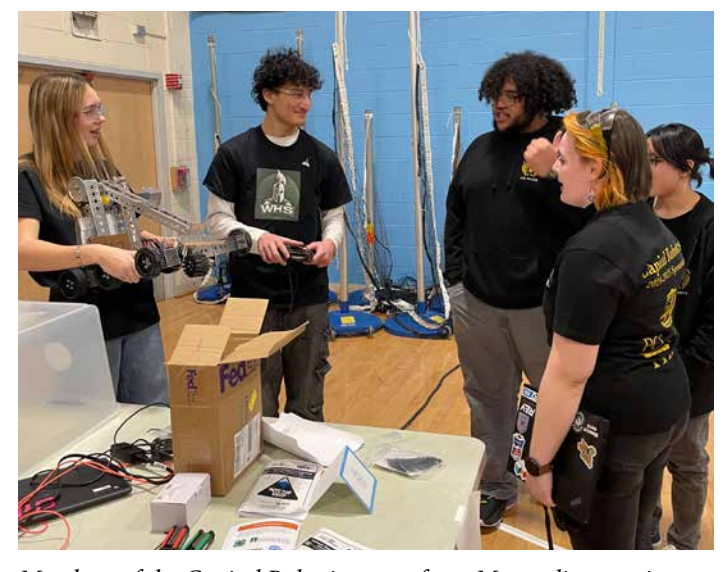
Members of the Capital Robotics team from Montpelier greeting the Winooski team and offering support, exemplifying FIRST's "Gracious Professionalism" values.

"I am so proud of the students for their hard work this season. They showcased their leadership by starting a robotics team at