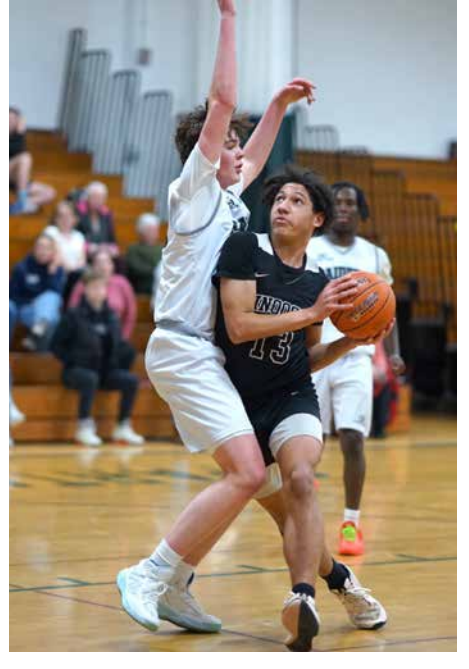
Boys Varsity game

The night's final game, Boys Varsity, carried a deeper significance. Stories of survivorship were shared, followed by a moment of silence honoring those affected by cancer. The game was played with heart and intensity, a testament to the event's greater purpose.