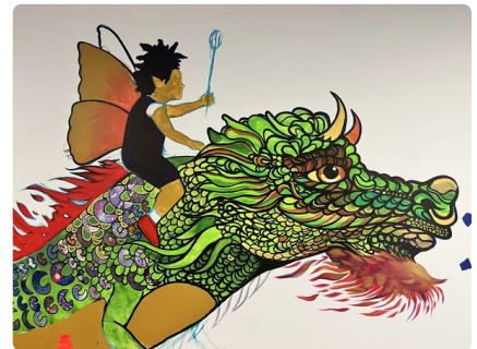
Dragon Mural in Progress