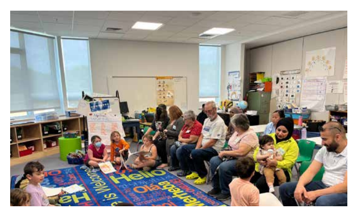
First Grade Celebration First grade held a celebration of learning with families. Students answered questions about the sun, moon, and stars. Then they read poems that they wrote.

JFK Elementary celebrated a year of accomplishments with a day of fun, including a trip to the Myers Memorial Pool!