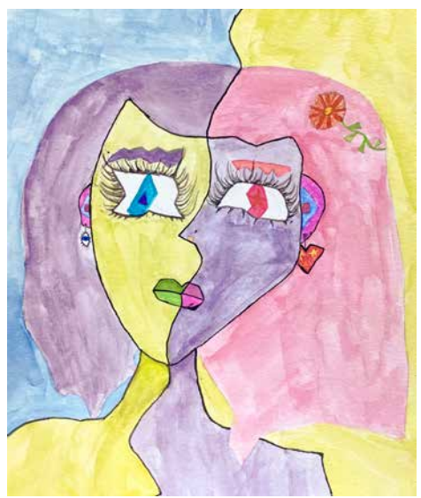
Diya, grade 7, 2-sided