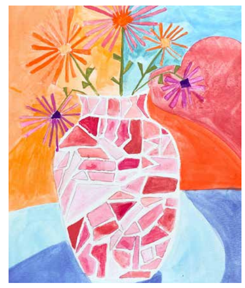
Olivia, grade 8, Shattered Light