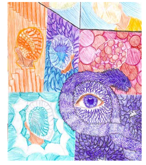
Gabby, grade 7, Face