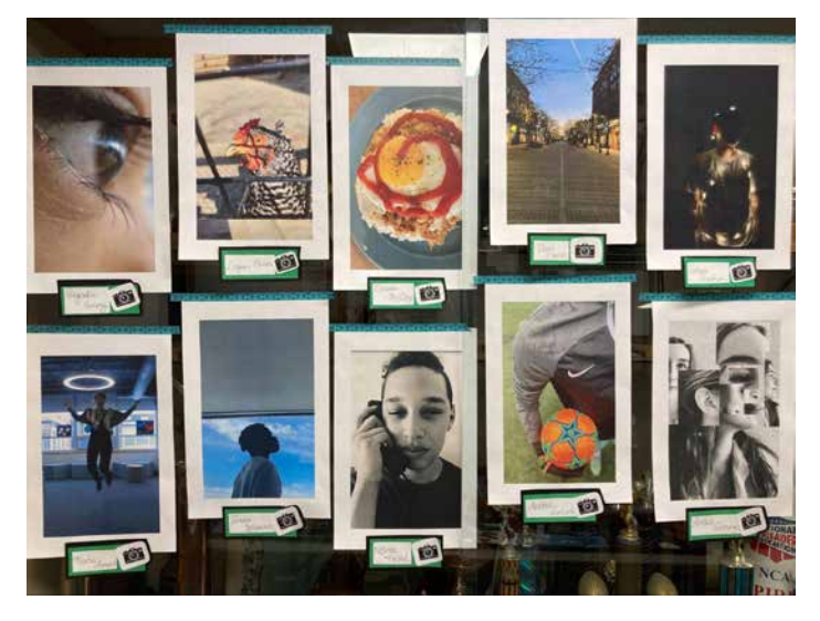
June Exposition of Learning at Winooski High School This year's JunePo was a huge success. JunePo is a final requirement for the spring semester and allows students to demonstrate what they learned in their classes.

Winooski High School athletes competed in Track and Field State Championships in Manchester VT. They worked hard all season to get a chance to compete with other schools in the division. Winooski athletes experienced PRs in every single event.