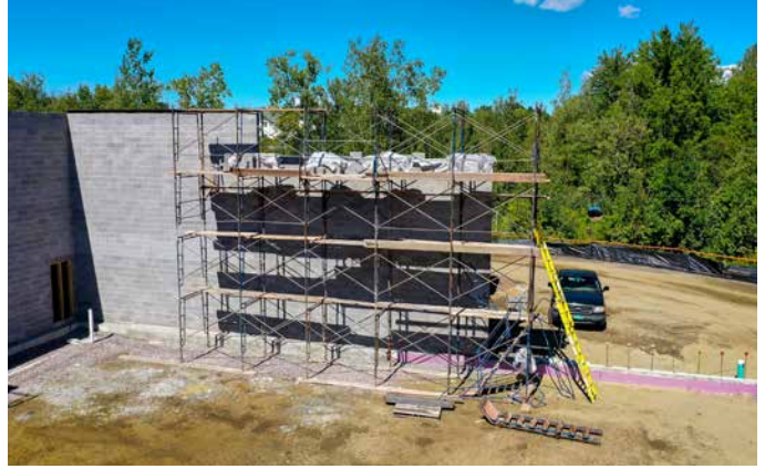
Looking north from inside new gym addition. Structural masonry walls being installed. End of Sept, roof steel will be installed. October, roofing system and concrete slab will be installed.