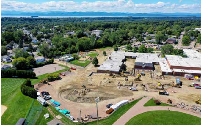
Looking west/southwest towards new Elementary addition. Excavation and concrete foundations are under way. In October, structural steel installation will begin.