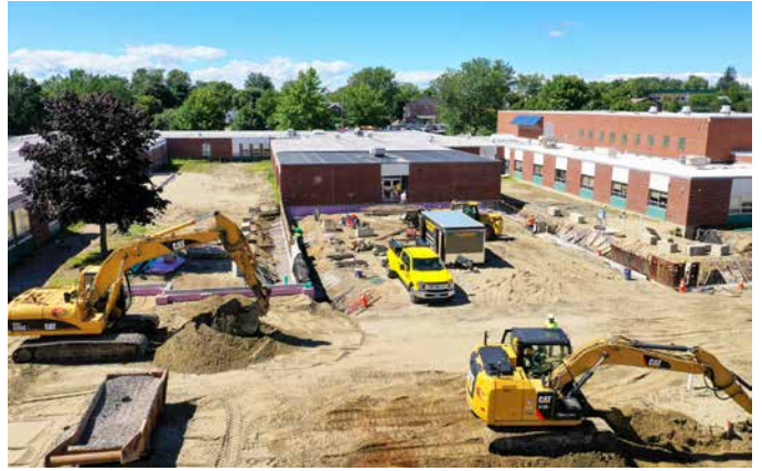
Looking west at existing Pre-K/K wing. The yellow truck is where the old Pre-K playground was located. Excavation and concrete foundations are under way.