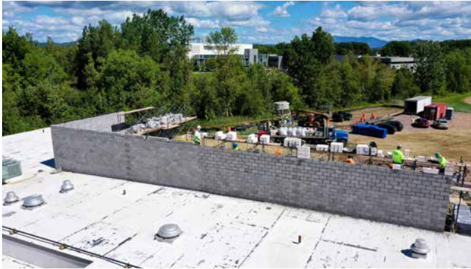
Looking east towards new gym addition. Structural masonry walls being installed. End of Sept, roof steel will be installed. October, roofing system and concrete slab will be installed. (existing roof vents are for visiting locker rooms)