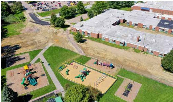
Looking northwest from above George Street parking lot. The area above the playgrounds is where new underground utilities were/are being installed. Also the temp path from JFK entrance is shown (crushed stone path across the dirt).