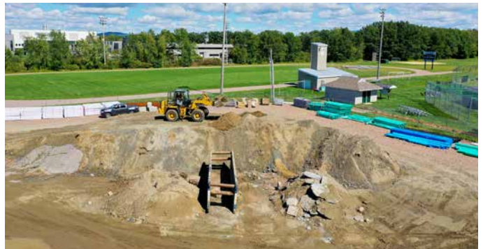
Looking northeast towards Field House. Showing stockpile of soil. Some of this material will be used as backfill of foundations, some will be spread around the site for new grades, some removed from the site. The metal box in front is a trench box, used during deeper excavations so the walls do not cave in.