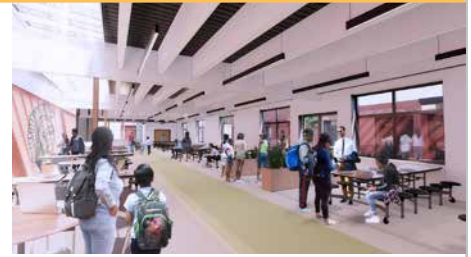
TruexCullins rendering of the new Winooski school district cafeteria.

“We are also investigating the condition of the under slab plumbing and testing the soil outside,” said Tom