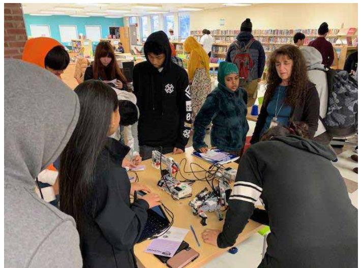
Robotics students demonstrating and explaining their learning and the trial and errors of coding.

Whether it is getting student work on display, showcasing a class project, or hosting a whole-school exhibition with community, we celebrate students' work and learning by making it visible.