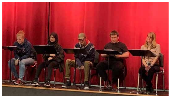
Student playwrights sharing their work.