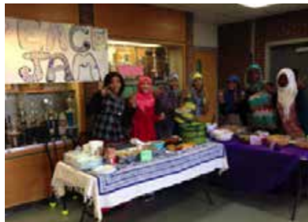
Some of the PeaceJam members hosting our International Bake Sale!