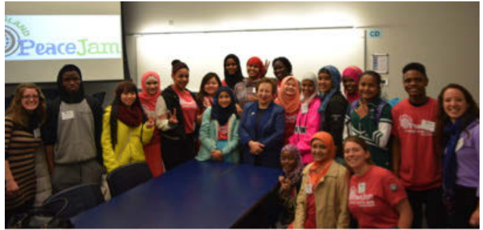
The Winooski Peace Jam group was privileged to introduce the 2003 Nobel Peace Prize Laureate, Shirin Ebadi @ the 2015 NE Peace Jam Conference on the UCONN campus!