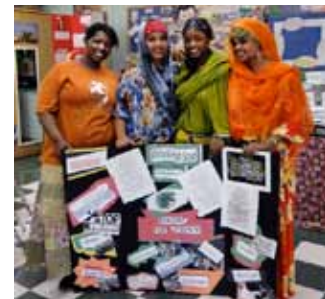
BCA Events and Winooski Welcome Center