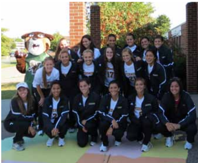
What a thrill it was for our students to meet the 2012-2013 UVM women's soccer team. These young women are a great example of achieving your goal by doing your best.

In literacy, we are focusing as a school on accountable talk read aloud. It is a slight shift from interactive read aloud. In accountable talk read aloud, the bulk of the work is placed on students. As we have learned in our evaluation process, the person doing the work is the one doing the learning. Accountable talk read aloud has the student doing the work; therefore they are doing the learning. Accountable talk read aloud requires children to read and discuss more and asks open-ended higher-level questions.