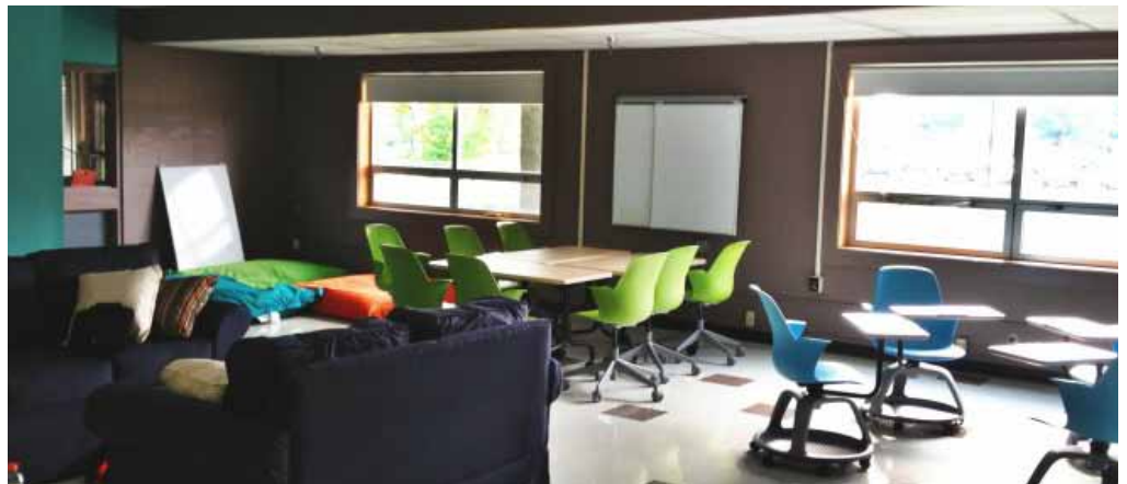
The iLab at Winooski High School has been designed to be welcoming to students and to foster learning with its alternative seating accommodations.

Along with students leading their own learning, we are trying to give our iLab students opportunities to learn by getting out into the community. The iLab has connected with the UVM College of Medicine in an effort to teach students about health and science careers. iLab students are also joining other students from around New England at the Nellie Mae Youth Leadership Institute, with the thought that they will bring their leadership training back to the school and their peers. Connections to VSAC, Burton Snowboards, Burlington High School, and other local Winooski business are on the horizon as well.