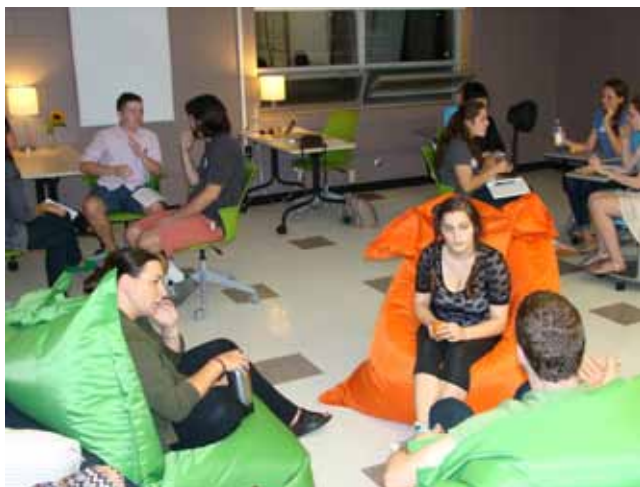
The Youth I-Team outlines their goals for the year at last month's meeting.