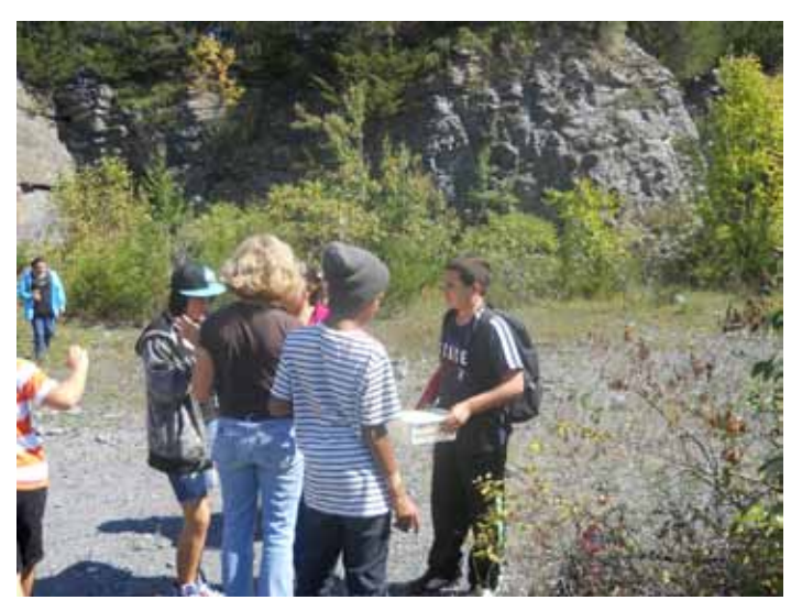
Team Velocity students collect fossils at Lessor's Quarry in South Hero.

Verse 3 Treat them well and you'll be swell Bring your friends over the bend and dig up the past Make them last Have a blast Dig up the past