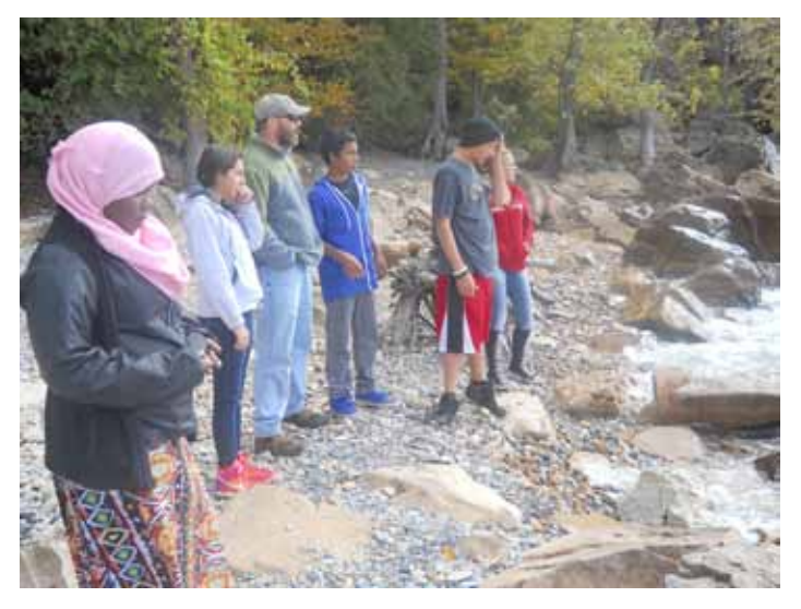
Team Velocity students on the shores of Lake Champlain at Lone Rock Point in Burlington to view the Champlain Thrust Fault.