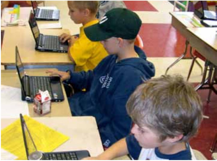
The boys are testing their working memories by playing memory games on computers during Memory Games .