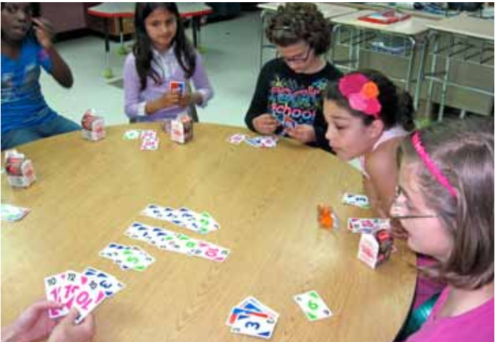
An intense game of Skip-Bo is being played in Strategy Games .