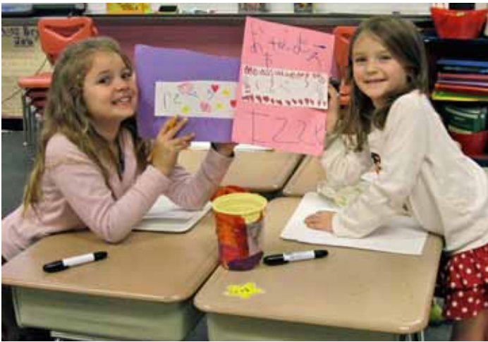
Isabella and Isabella are learning how to read and write in Japanese during their World Tour Japan afterschool program.