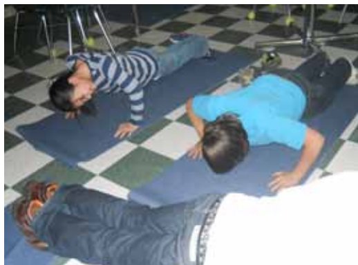
Students learn how to do proper pushups on their yoga mats.

supplied with mats for this activity, and students will soon have the option to participate in a leadership training course offered by Quinlan.