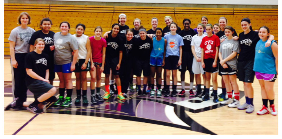
The Winooski Middle School girl's basketball team after a practice with their mentor team, the Saint Michael's Women's basketball team.

A personalized and proficiencybased education system starts with the recognition that each student is a unique individual. The heart of our work as a school is to recognize, value, and nurture