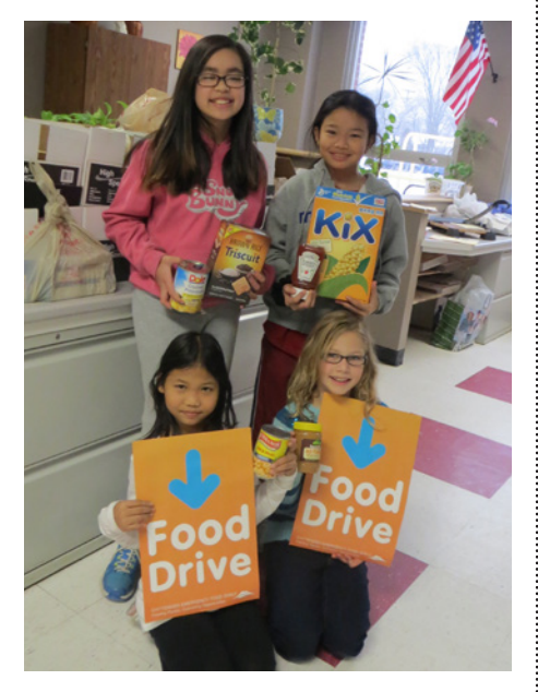
The J.F.K. Student Council hosted a canned food drive to benefit the Chittenden Emergency Food Shelf. Many thanks to all our generous families for your donations.

Student will focus primarily on how animal adaptations help them survive the winter. Such as how their fur grows thick, their feet expand and how they find food. Ask your child about animals they see!