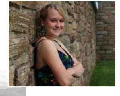
The WHS French Club is offering a special deal to WHS Seniors: an individual 1½ hour photo session for only $45!

If interested in scheduling a session, contact Madame Saffo in Room 121, call 383-6195 or email <u>vsaffo@</u> winooski.k12.vt.us.