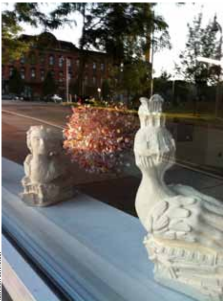
Winooski artist Leslie Fry uses traditional methods, including drawing, modeling and casting with materials that range from paper and plaster to concrete and plastic, to create decidedly nontraditional works.