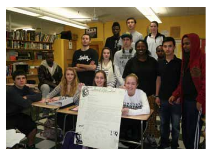
The High School students in the Government class wrote an oversized letter to President Obama last month.