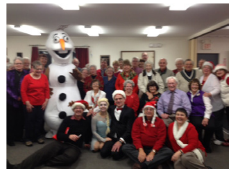
Many thanks to the Vermont Lyric Theater and "Olaf" for making our Winter gatherings so much fun!