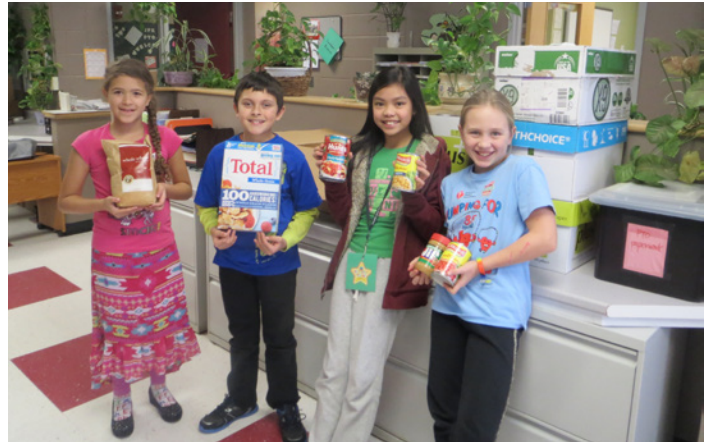
JFK Student Council members say "Thank you to JFK families for your generous donation to the Chittenden Emergency Food Shelf!"

When the performance was over the two person troupe answered questions from the audience and put their minds to ease assuring them the puppets did love the snow and they would all visit Vermont once again real soon.