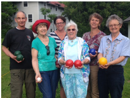
The evening Bocce crew - come join us!