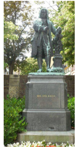
Johann Sebastian Bach

This was a trip of a lifetime for me. There was so much rich history it was hard to take it all in. While much of this trip was about the classical composers there were several opportunities to see and hear music of all kinds. There were many street performers singing many different styles of music. A fun time was had by all.