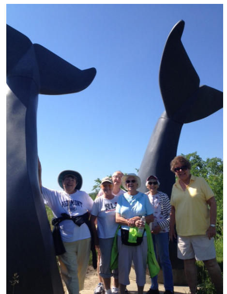
The WSC Walking Group travels every Friday to a new location to walk - Variety is the spice of life!

Bocce and Walking Groups continue all this month and you are invited to drop in for both! Bocce is every Tuesday at 5:30. Walking groups are every Tuesday