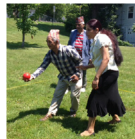
Our Bhutanese seniors learning to play Bocce.

Stay tuned! Our fall schedule will include a leaf peeping adventure, “Back to School” talks on a variety of subjects, Wii bowling, and much more!