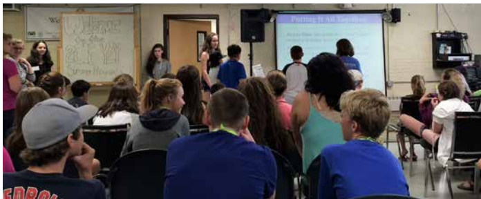
Youth advisors coach middle school students at DY2Y 2016.

We hope you have a wonderful rest of your summer! Stay in touch and be on the lookout for community dinners to resume starting in September.