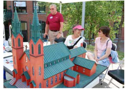
Winooski Historical Society