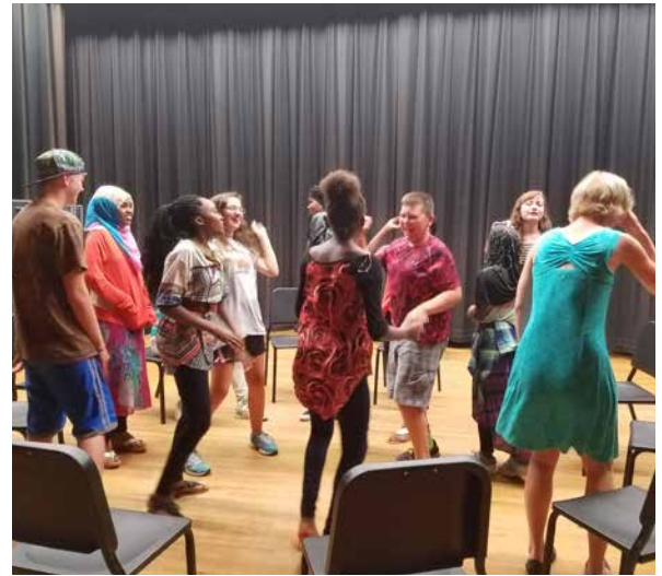
Students Practice their Improvisation Skills in All The World's A Stage